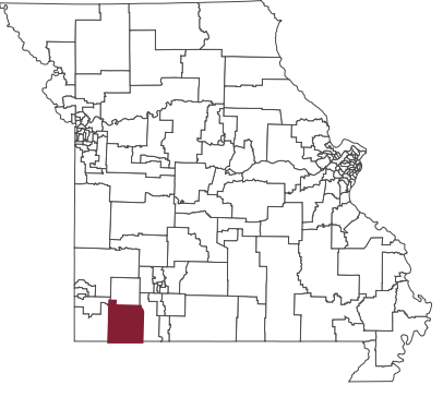
District population: 37,018