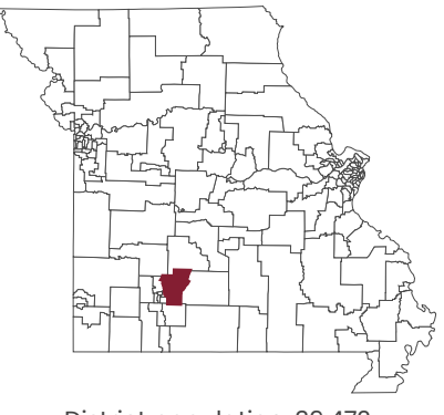
District population: 39,472