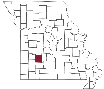
County population: 31,748