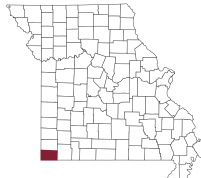
County population: 22,782