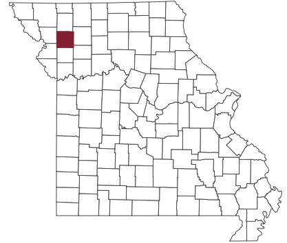
County population: 12,526

MU Extension in: Clinton County, DeKalb County