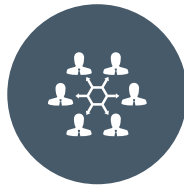
Excellence in Engagement and Outreach