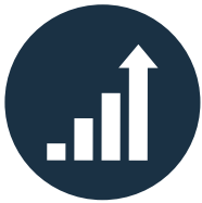
Excellence in Student Success

The Missouri Compacts for Achieving Excellence provide unifying principles that inform and guide the four universities and their strategic plans. Learn more about the compacts, below, at http://umurl.us/prespri .