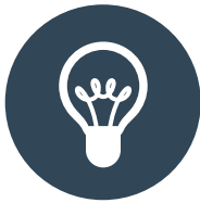
Excellence in Research and Creative Works